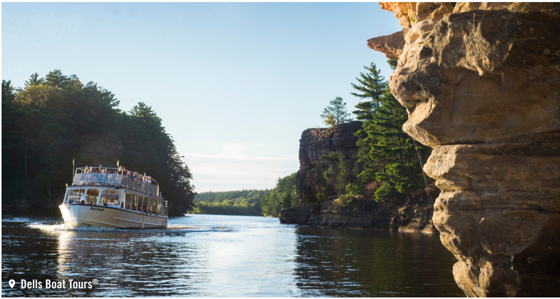
📍 Dells Boat Tours®