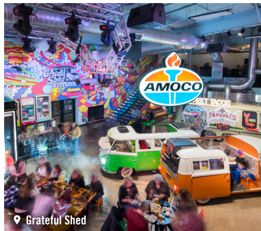
📍 Grateful Shed