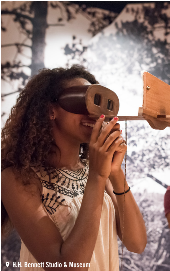
📍 H.H. Bennett Studio & Museum

Buffalo Phil's Grille is soon to be your family's favorite restaurant. Their menu includes pizzas, rotisserie chicken, steaks, burgers, Lil' Buckaroo meals and delicious BBQ.