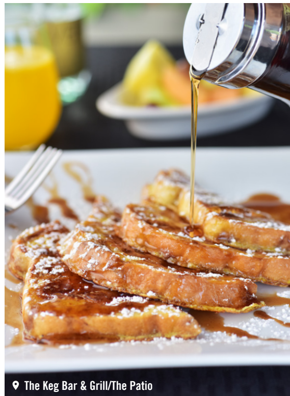
The Keg Bar & Grill/The Patio