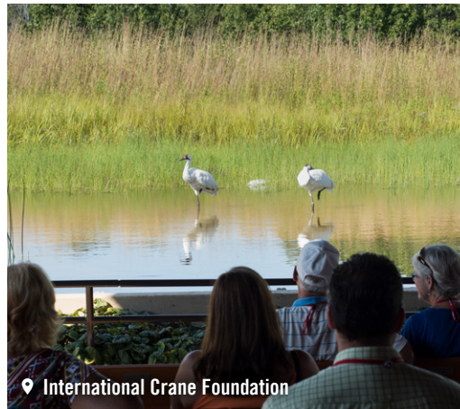
📍 International Crane Foundation