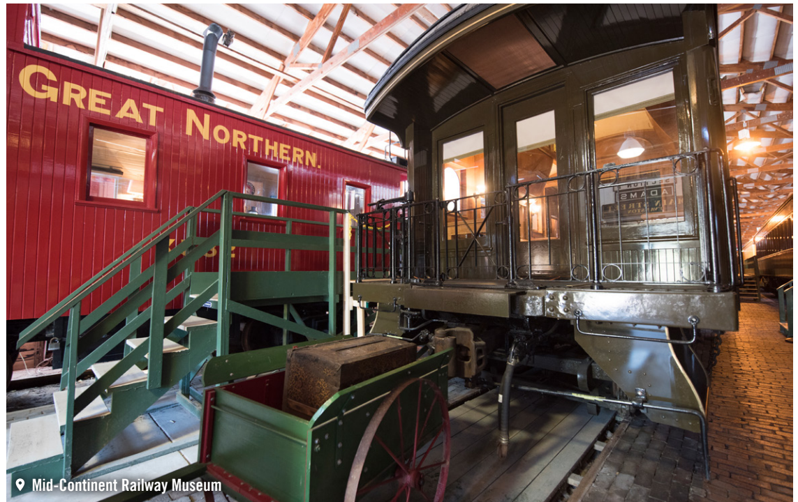
Mid-Continent Railway Museum